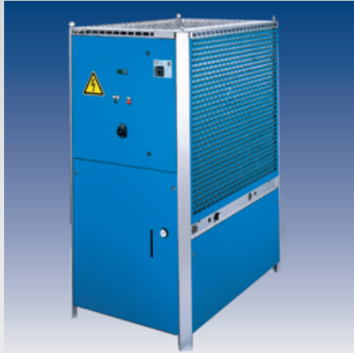
SVK - Water chiller with a cooling capacity of 15 to 130 kW, with tank and pump. Compact design with high temperature accuracy.