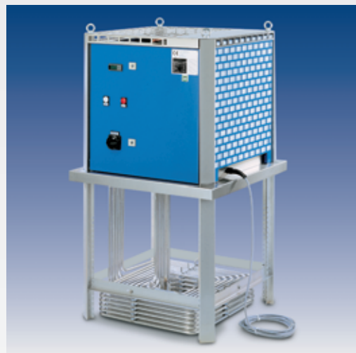
TRK - Immersion chiller for cooling lubricants with a cooling capacity of 2 to 120 kW. Service-friendly in maintenance and cleaning.

In addition to our standard product range, we offer you solutions for liquid cooling in all industrial applications.