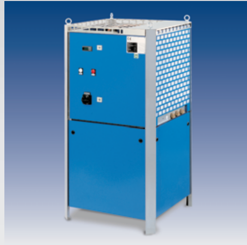
VWK/1 - Water chiller with a cooling capacity of 2 to 70 kW, with tank and pump. Compact design with high temperature accuracy.