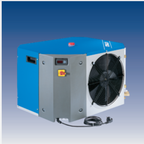
CHILLY - cooling-water chiller with a cooling capacity of 0.8 to 4.5 kW, with tank and pump. Space-saving and reliable.